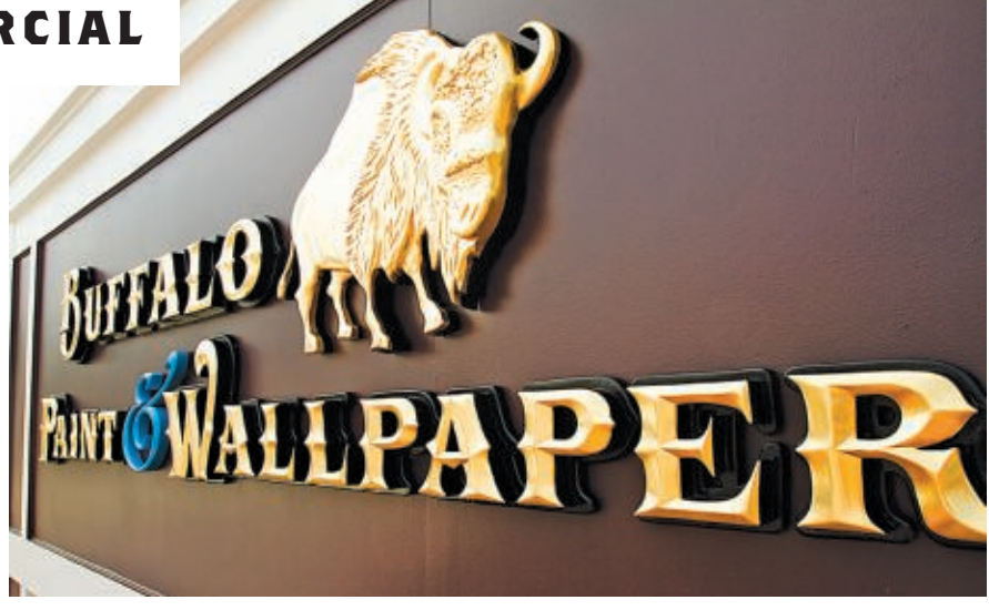
We produced these individual letters using a carving technique we call "roughhewn" to induce more sunlight to be captured and reflected in order to further bedazzle the viewer. The letters are 24 in. high and span 40 ft.

It's invariably rewarding to have a happy customer pose in front of new handcrafted, gilded letters fabricated by individuals, not machines. But, wait, there's more! In addition