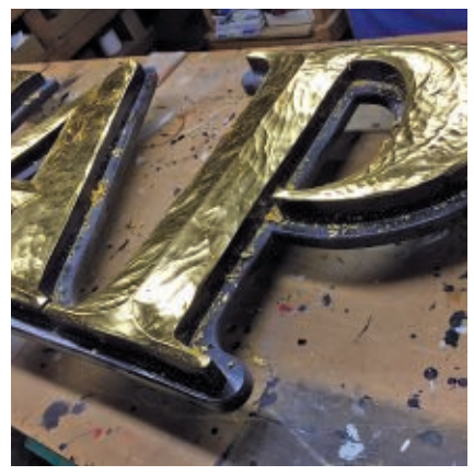
A close-up of the "rough-hewn" carving and gilding in production. The effect is achieved by carving "random" strokes with No. 2 and 3 sweep gouges.

each hole, as well as on the outline's back. We're always careful never to touch gilded surfaces; an outline really helps in this regard.