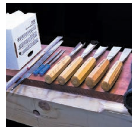
Tools required to carve letters include chisels ranging from sweeps of 1 to 9, and various-grit files and sandpaper.

After the letters are cut out, the next step is prismatic carving. Here you will need an assortment of chisels with sweeps ranging from 1 to 9, some aggressive files, and sandpaper. If our gilded individual letters are going to be installed on a light background surface, we