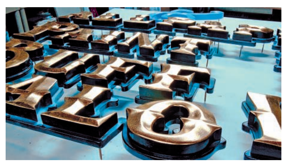
Francis Lestingi outlines his letter-carving process, which yielded these beautiful carved, gilded, beveled letters.

tangle with a power cord really facilitates the milling, but be sure to have enough extra batteries to ensure continuous operation. You only need two blades: a fine tooth for straight cuts, and a scroll blade for tight curves.