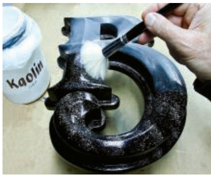
Two topcoats of bulletin, high-gloss enamel were applied to the front side and one on the back. The first topcoat is always a light color, while the final coat is always black.

When we apply the uncontaminated size with a lettering quill to assure sharp, crisp edges, the size is quite visible, contrasting clearly against the kaolin. We