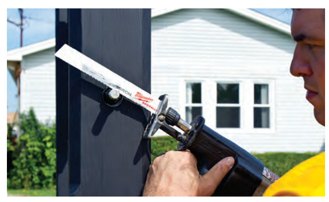
Using a cordless reciprocating saw, we trimmed off the excess threaded rod. It wasn't actually excess; we needed this extra rod length to move the panel and brackets to the left and right.

which comprise rustproof baked and powdercoated aluminum, fit around the panel's end-grain, which we pre-groove to fit the channel. We affix the bracket to the panel with stainless-steel lag screws, and