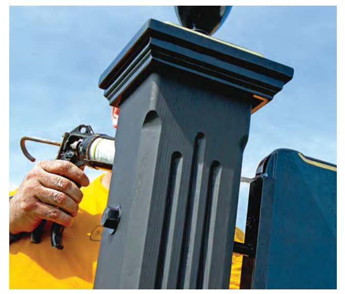
We secured the detailed mahogany finials and caps to the post tops. Silicone caulk on the uncoated cap surface and the unstained post top created a very good bond. To prevent water from seeping down between the brackets and the panel, we applied a silicone seal.

weathering problems. We also use the "floating" concept for panels while working in the studio and transporting them for installation. Whether or not a panel is double-