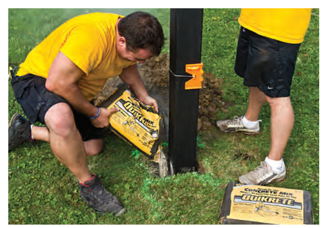
We secured the posts with 120 lbs. of dry cement mix per post. The dry powder was packed in with the chisel end of the tamping rod. Eventually, ground water produced a very strong cement pod at the base of each post.