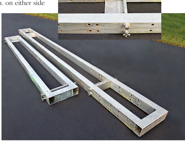
We designed these installation jigs to allow us to mark exact locations for post-hole digging and for maintaining precise spacing between posts. Shown are a large version capable of handling up to 4 x 8-ft. panels, and a smaller version used for 3 x 5-ft. panels. The insert outlines the adjustable platforms that sit atop the posts.

Panel: Gilded, mahogany panels, fabricated by Signs of Gold