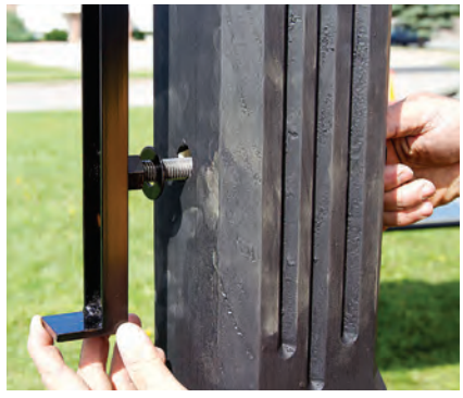
With the posts firmly set, the custom aluminum brackets were inserted into the pre-drilled post holes. The substrate panel was inserted into the channels to rest on the "shoes."

We use the jig to indicate where the holes will be dug. When the holes are dug with the posts inserted, we place the jig atop the posts to create proper spacing and leveling.