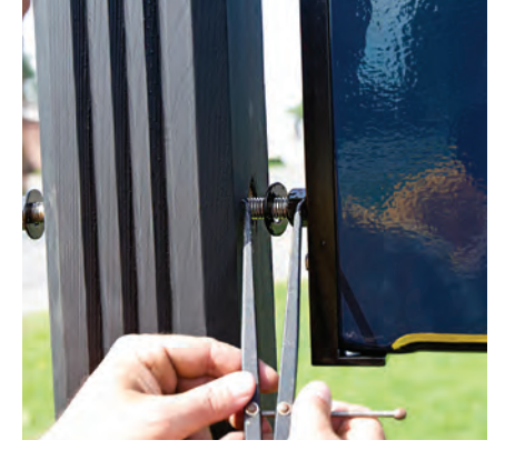
A divider tool determined equal spacing of the panel between the posts. The panel, now attached to the brackets, could be shifted to the left or right until centered.