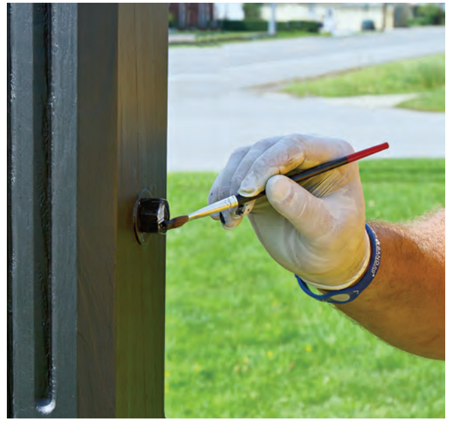
We pre-painted all installation hardware prior to the install, but there is usually need for a touch-up. We used an inexpensive, re-usable brush and 1Shot<sup>®</sup> enamel in a medicine bottle.

to the panel and posts, the end result is a "floating" substrate. The panel doesn't touch the posts; there's a 2-in. gap between them. Keeping them separated helps prevent