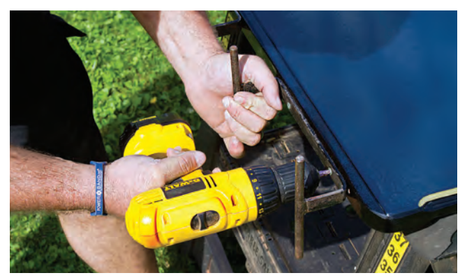
We placed the panel on foam-rubber cushions, which were on workhorses, and removed the steel handles that enabled the panel to "float" on the truck floor while en route to the installation site. To seal the screw holes, we applied kneadable, wood-epoxy putty. Other pre-drilled bracket holes accepted lag screws.