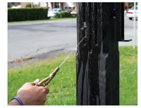
The detailed, treated 6 x 6 posts, which were stained prior to installation, inevitably get dusty while being handled during their insertion. We cleaned them by spraying water from a pressurized, garden-spray dispenser.

we designed channel brackets, which we customize for each new panel. At the base of each bracket is a "shoe," on which we rest the weight of the panel during and after the installation. The brackets,