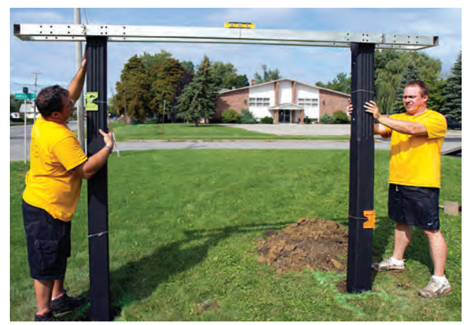
With the 6 x 6 posts inserted, the installation jig was placed atop the posts to ensure that the posts are level and spaced accurately. Vertical levels were also attached to the posts to ensure that the posts are plumb.