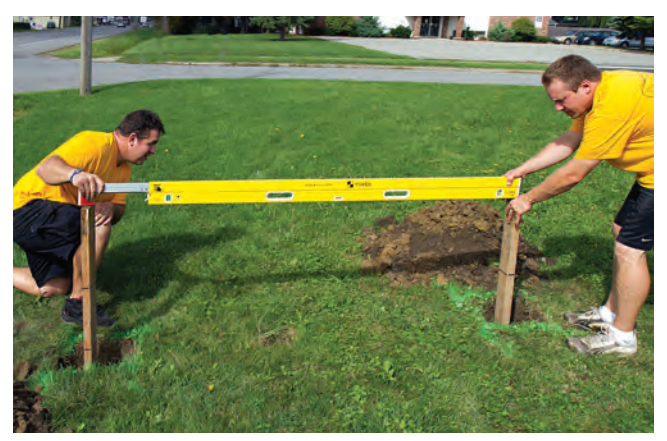
When the depth has been achieved, "levelers" are inserted, and a large, adjustable level is used to check if the depths are equal. If so, the 6 x 6 posts are inserted. If not, more digging is done until we've made it level. The "levelers" are 2 x 4s with a small segment of a 6 x 6 post at their ends.