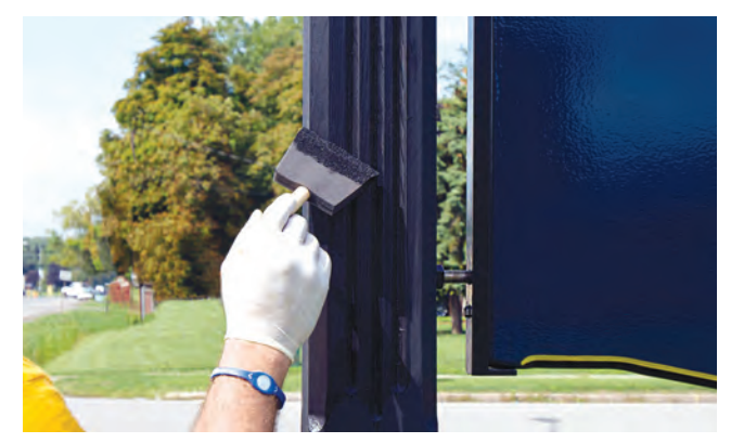
Even though we previously washed the posts with water, we gave them a fresh coat of stain with a foam brush to really freshen them up.

the brackets to the posts with threaded rods, which are welded to the brackets. The 6 x 6, treated posts have pre-drilled holes to accept the threaded rods, nuts and washers. We detail these posts with