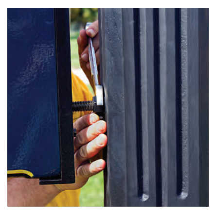
After we centered the panel, which left 2 in. between its edge and the posts' inner surface, we tightened the inner nuts first, followed by the outer nuts.