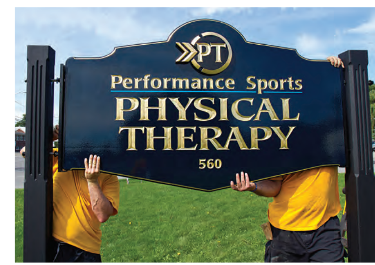
We inserted the panel into the channel bracket slots, and it rested securely on the "shoes" while we prepared for the lag screws' insertion.