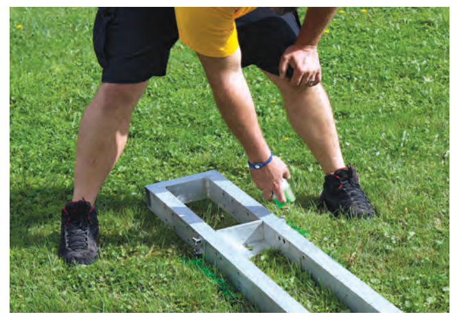
With the placement of the sign determined, the installation jig was used to mark the digging locations with spray paint. We dug the holes about 16 in. sq. and 36-42 in. deep. Local authorities determine varying depths for frost-line requirements.